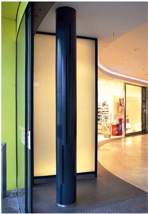
Shopping centre entrance