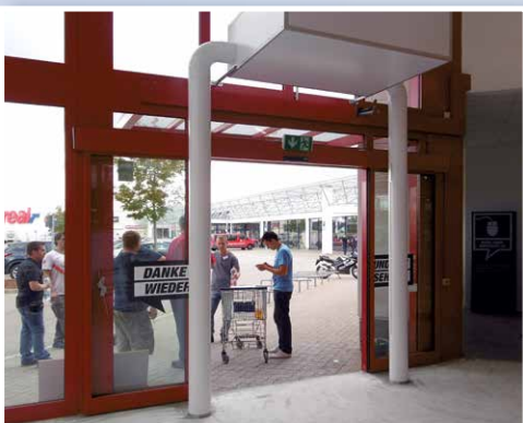
DIY centre entrance